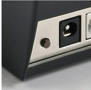
Innovative "C" button makes label Calibration simple and fast