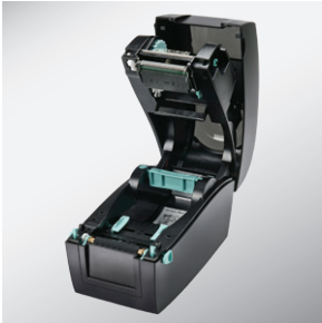
Modern clam-shell design makes it simple to load labels

The small footprint RT200 is a perfect printer solution where space is tight and value pricing is important