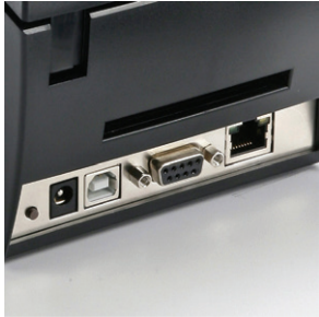
Ethernet, Serial and USB are standard features adding flexibility and power